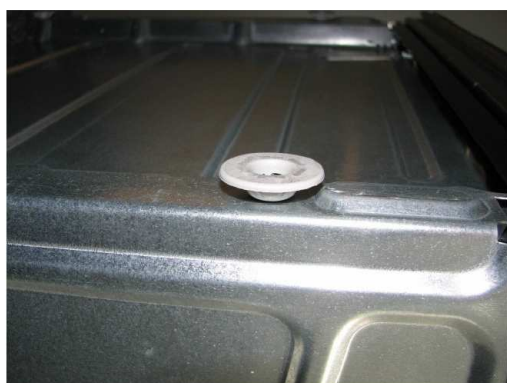
foot under oven

Service Kit 4812 310 39226 : consisting 4 feet and 4 screws