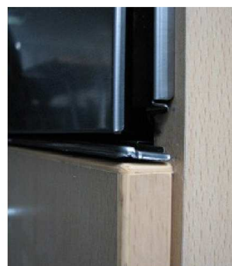
bottom trim too near to furniture